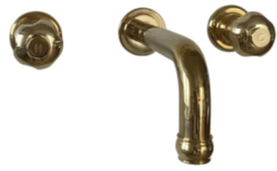
Insert H & C