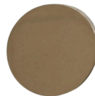
Holder base plate