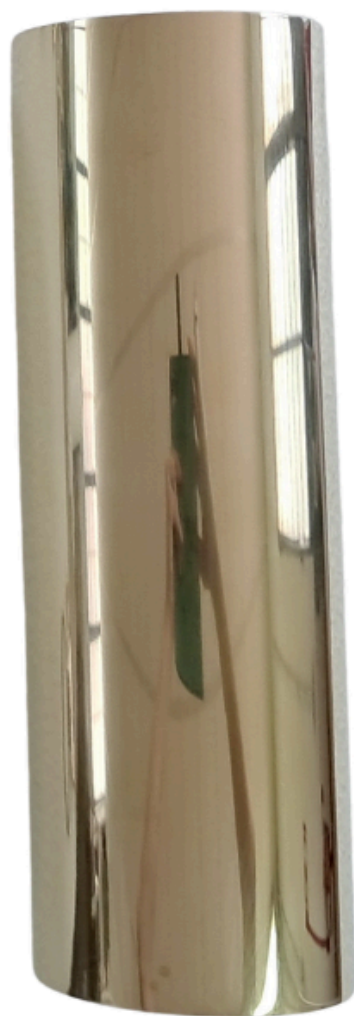
Solid brass toilet brush holder body