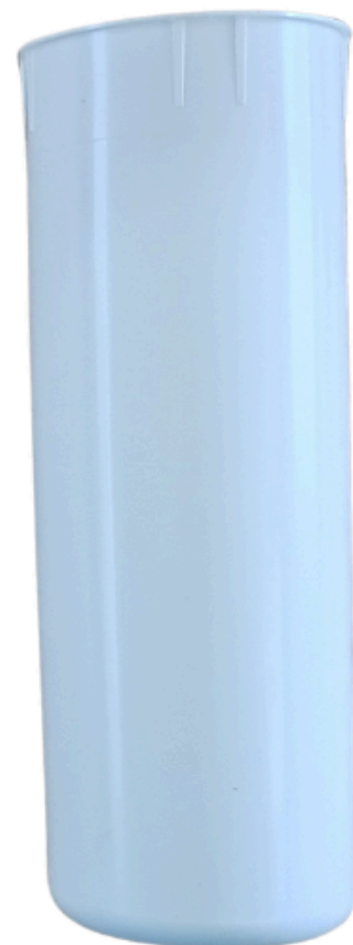
Removable inner plastic liner