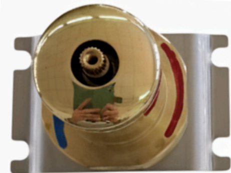
Progressive mixer with cartridge included