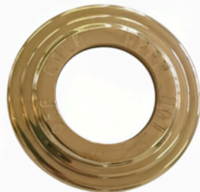
Mixer back plate