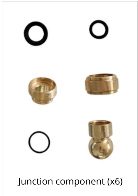
Junction component (x6)