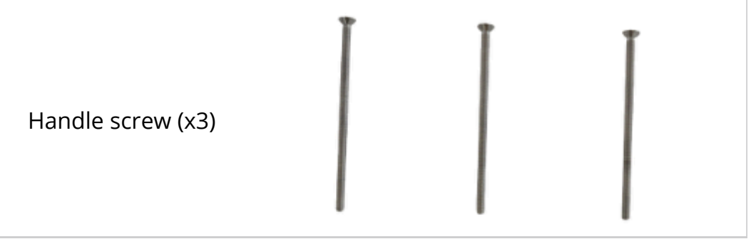
Handle screw (x3)