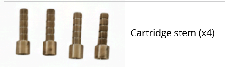
Cartridge stem (x4)