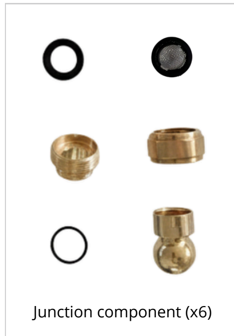
Junction component (x6)