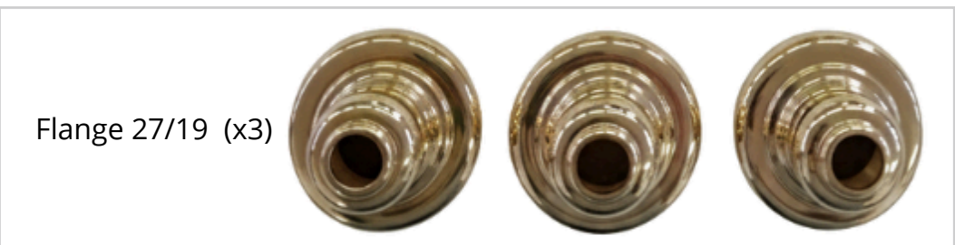
Flange 27/19 (x3)