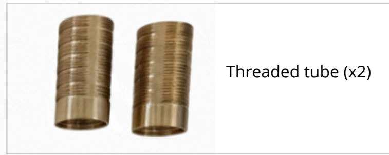
Threaded tube (x2)